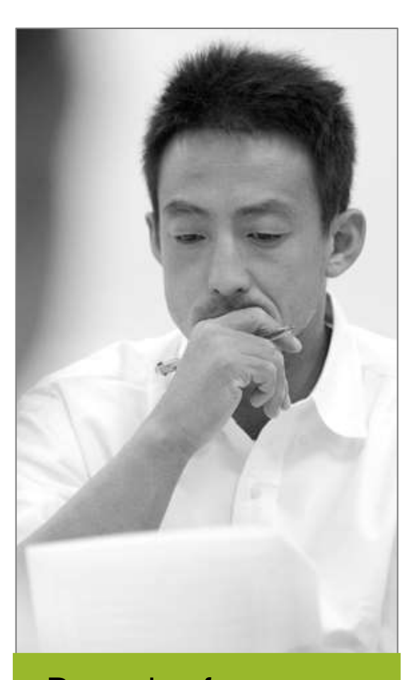
Preparing for unexpected changes