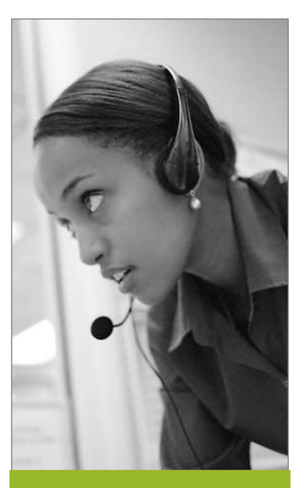
Speed and flexibility