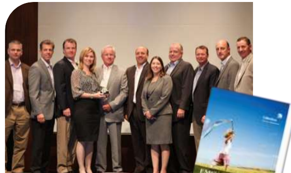
2012 Blue Sky Supplier Sustainability Award