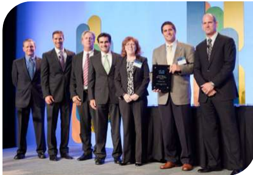
IT Collaboration Award and EMS Partner of the Year