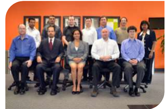
Best of BI Editor's Choice Award 2012